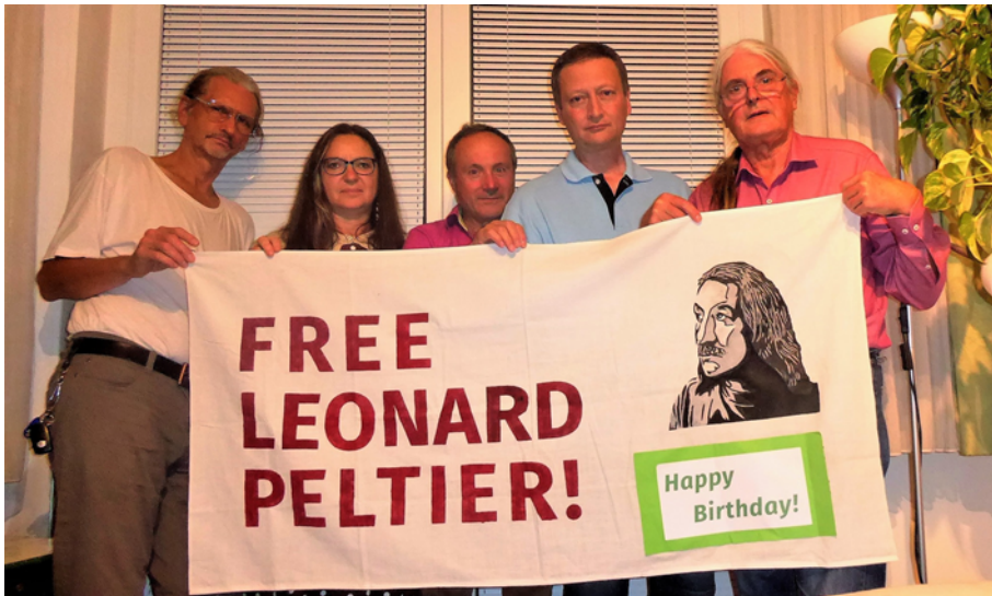
Free Leonard Peltier: Solidarity with the longest imprisoned indigenous political prisoner