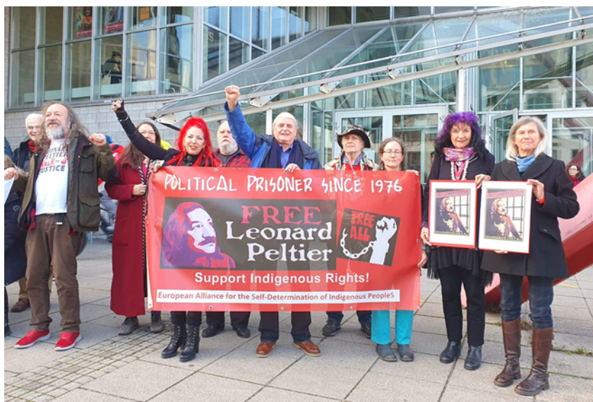
Action by the "European Alliance for the Self-Determination of Indigenous Peoples" for the release of the political prisoner Leonard Peltier, who has been in US prisons for 48 years, on the occasion of the "North American Film Festival: Indians and Inuit" in Stuttgart

Regular distribution of the newsletter by e-mail to all interested parties registered on our homepage: News of current events and new articles on our website about the situation of Indigenous Peoples of North America. Regular posts and links of current articles and videos on our Facebook page ( https://www.facebook.com/arbeitskreisindianer/ ).